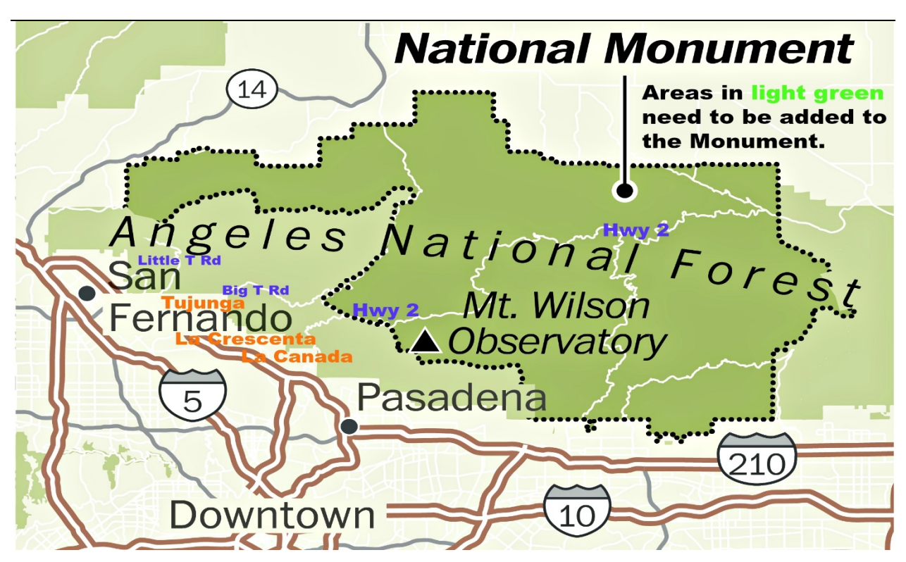
Expanding the Monument could provide added resources for recreation and visitor education for the San Gabriel Mountains above La Canada, La Crescenta and Sunland-Tujunga. Expanding the Monument would give us more leverage to oppose high speed rail routes through the forest.

A new management plan being developed for the National Monument that should address innovative approaches like transit to trails. We hope to see more programs for youth and families. Expanding the Monument could also give us more leverage in opposing high speed rail