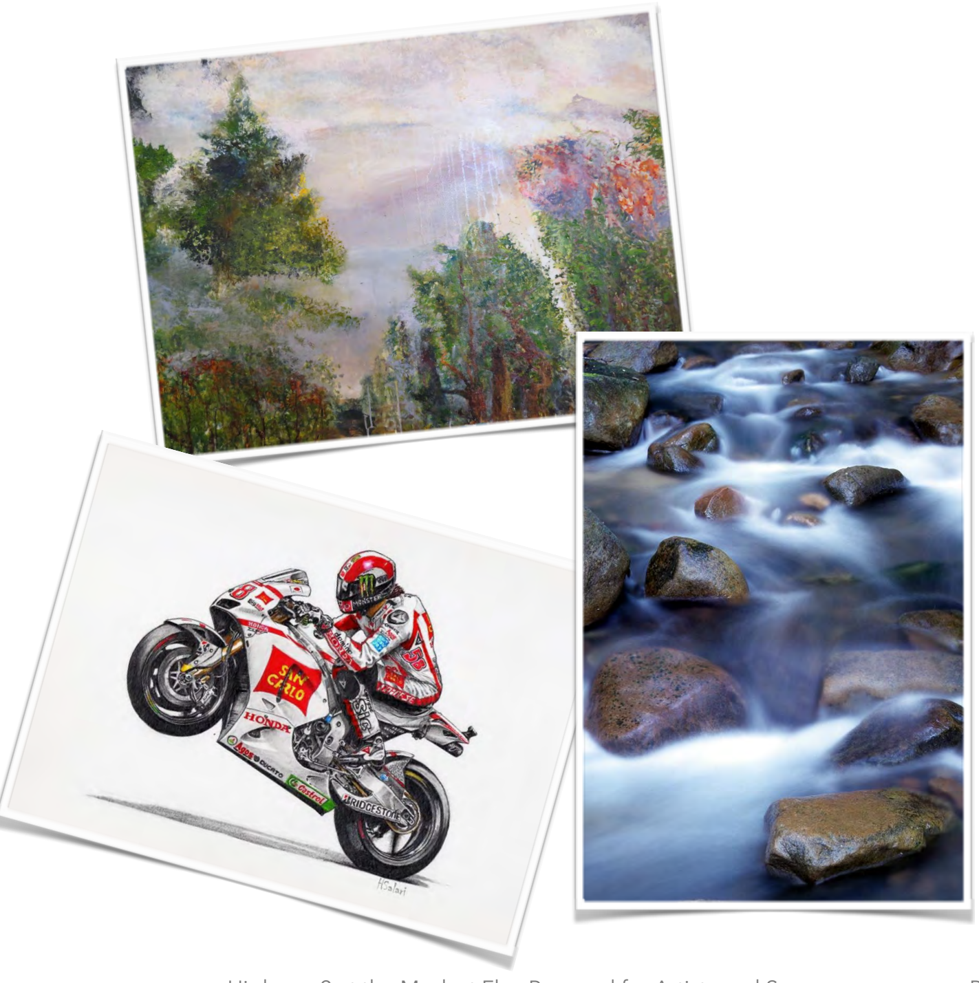
Highway 2 at the Modest Fly - Proposal for Artists and Sponsors