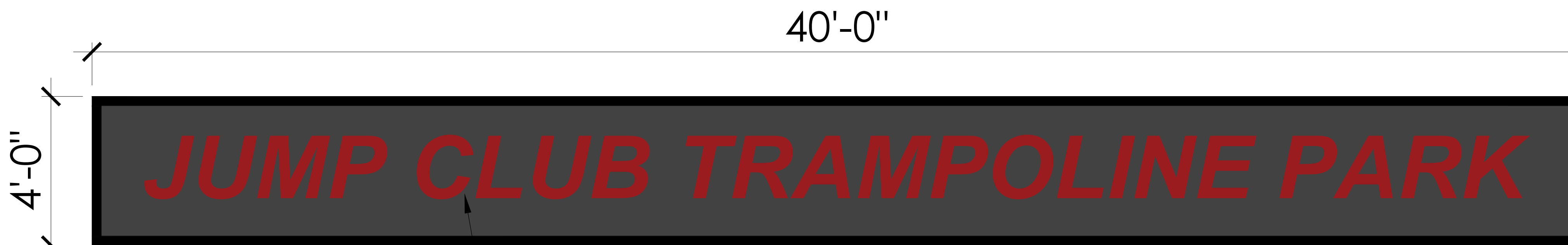
A WALL SIGN SPEC 1/2"=1'-0"

(N) RED LETTER WITH BLACK BACKGROUND STICKER SIGN TO REPLACE OLD ONE